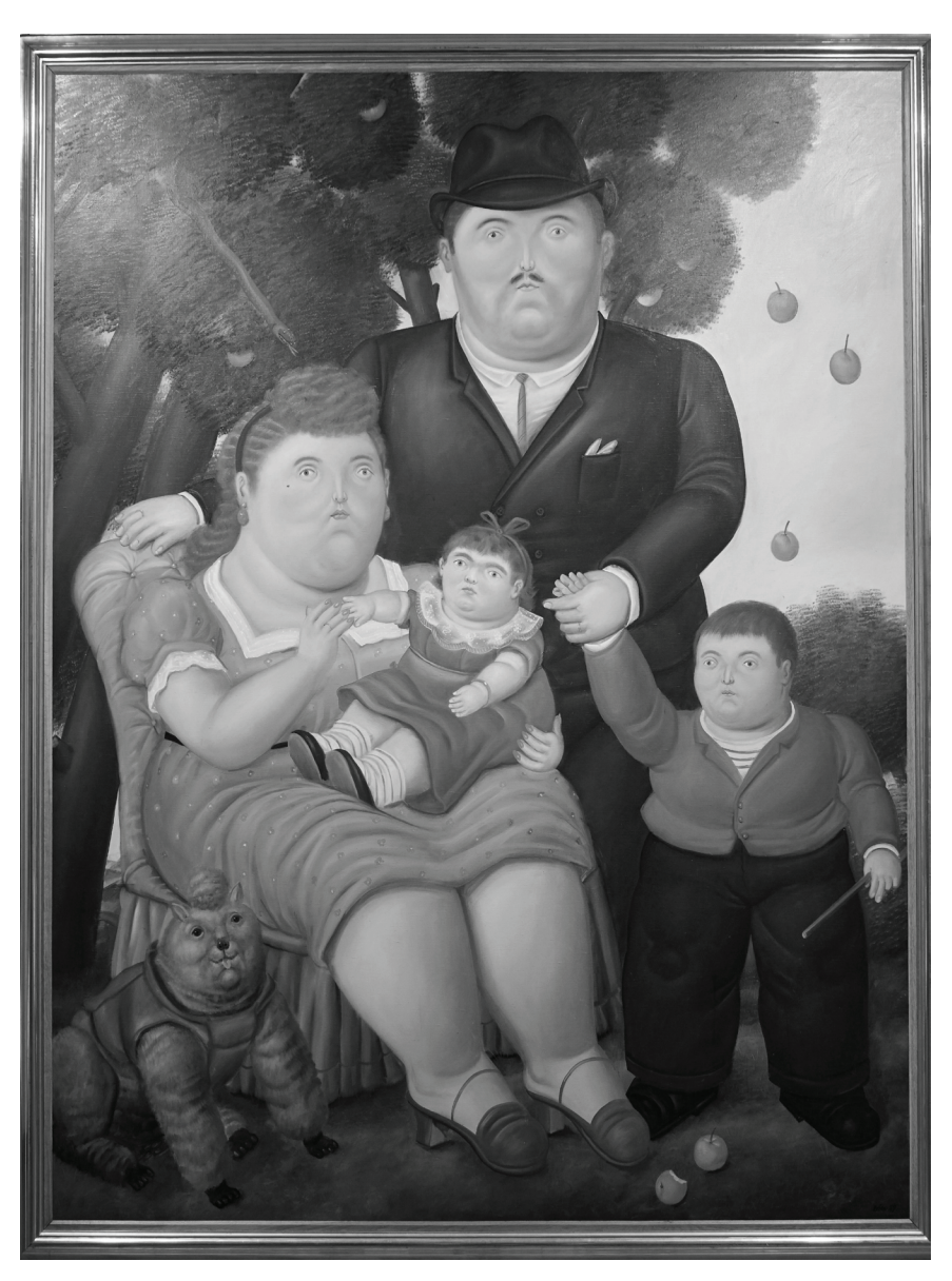
[Source: "Una familia" (A family), 1989, Fernando Botero, Museo Botero, Bogota, Cundinamarca, Colombia. Age fotostock / Alamy Stock Photo.]

With explicit reference to the stimulus and your own knowledge, discuss a philosophical issue related to the question of what it means to be human.