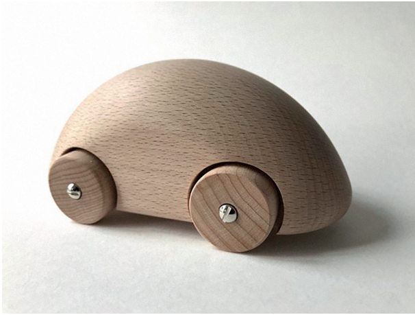
Figure 5: Playsam Streamliner Classic wooden body