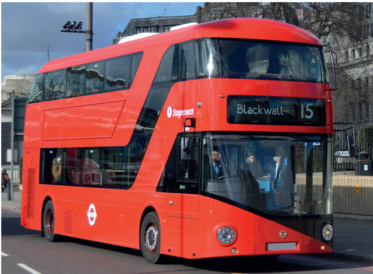
Figure 7: A new Routemaster bus