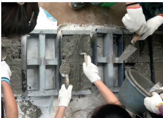
Figure 12: Concrete being moulded into bricks