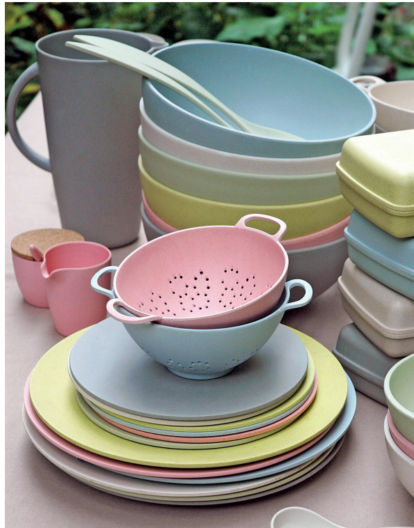
Figure 14: Assorted pieces of Zuperzozial kitchenware