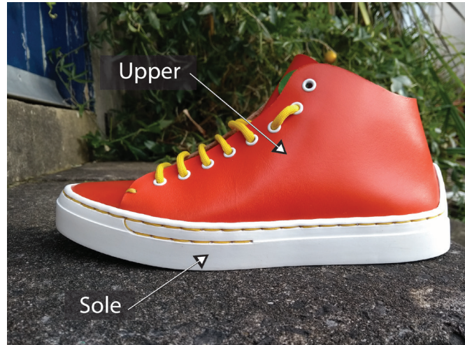
Figure 2: Greenfeet Vertue shoe