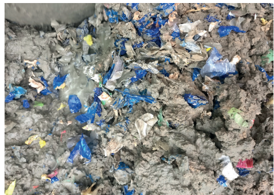
Figure 11: Shredded plastic added to concrete