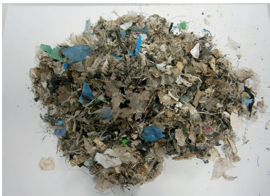
Figure 10: Shredded plastic bags