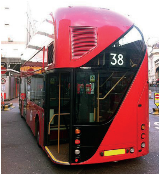
Figure 8: Routemaster bus