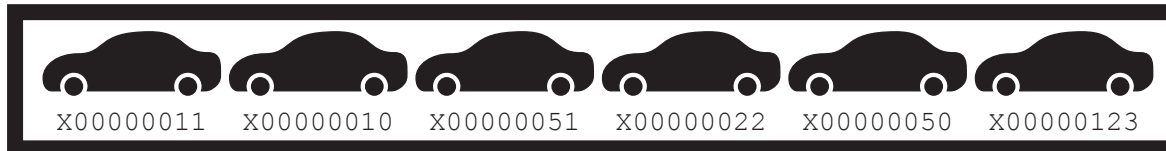
Figure 5: Cars parked in the parking area

The class Stack, which contains the Vehicle objects, has the following methods: